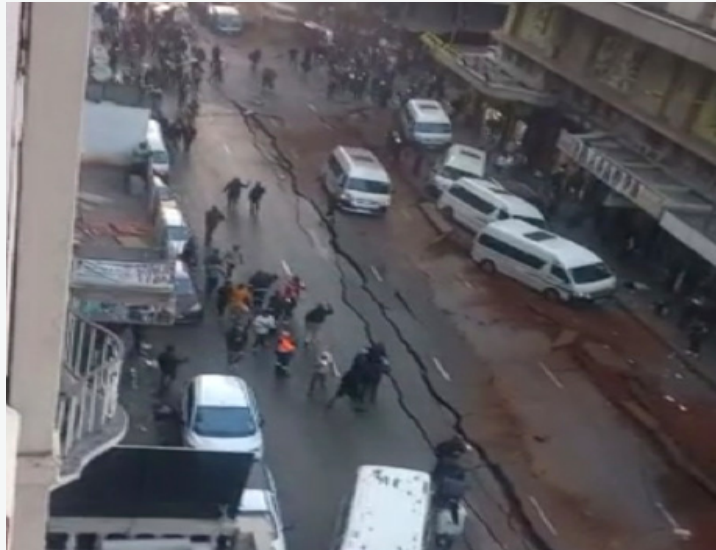
Gas explosion ripped apart Lilian Ngoyi Street in the Joburg CBD.

The city placed medium interventions which included the restoration and repair work and estimated repair cost for this was approximately R178 million.