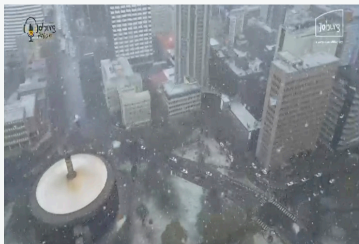
Snowy Jozi Metro Centre on the 7 July 2023.

According to Johannesburg’s City Manager, the ‘type of gas that fuelled the explosion is Methane, which is lighter than air and travelled up along the services tunnel, from an unknown source to the crest of the tunnel near Von Brandis Street’.