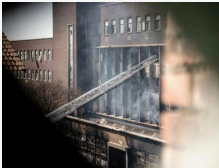
A view of emergency services in the Johannesburg CBD attending to the Marshalltown building fire, which claimed the lives of 77 people.

With regard to the five-storey Marshalltown building fire that killed 77 people in August, a commission has been appointed by Gauteng Premier Panyaza Lesufi to investigate the cause of the fire and the prevalence of hijacked buildings in the Joburg CBD.