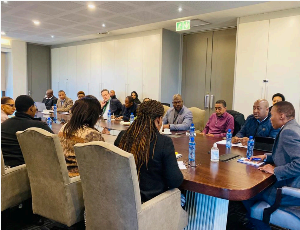
In-preparation: The various departments of COJ with DIRCO in talks ahead of the XV BRICS Summit 2023.